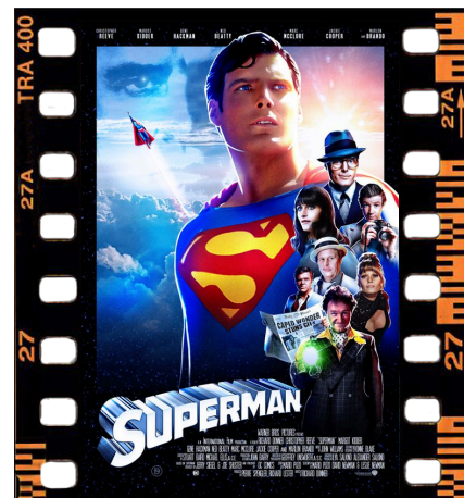
JULY 9 SUPERMAN