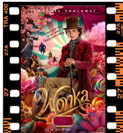
JUNE 25 WONKA