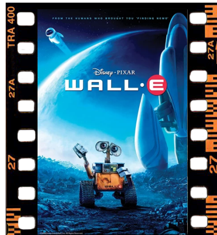
JULY 16 WALL-E