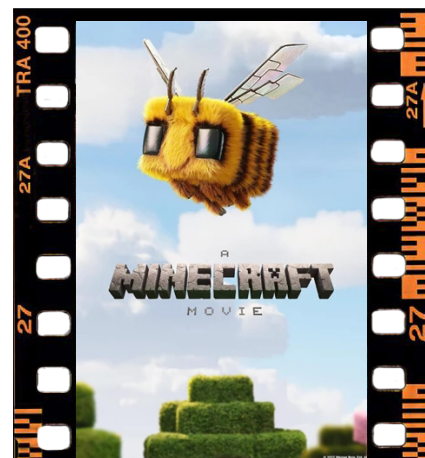
JULY 23 A MINECRAFT MOVIE