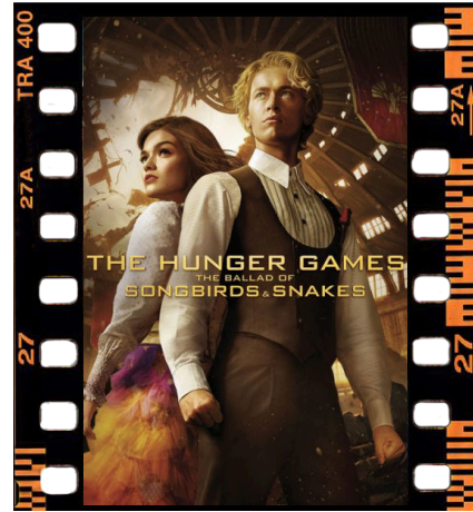
JUNE 4 HUNGER GAMES: THE BALLAD OF SONGBIRDS & SNAKES